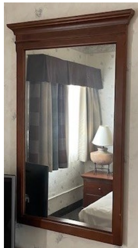
#14 QUANTITY: 22