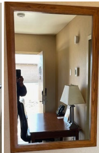
#16 QUANTITY: 2