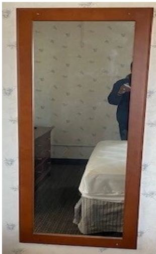
#13 QUANTITY: 14