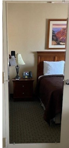
#15 QUANTITY: 10